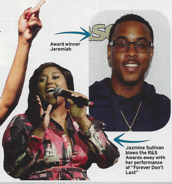
Jazmine Sullivan blows the R&S Awards away with her performance of "Forever Don't Last"