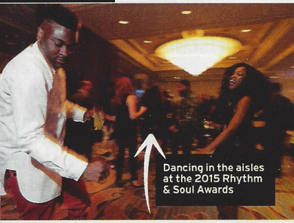
Dancing in the aisles at the 2015 Rhythm & Soul Awards