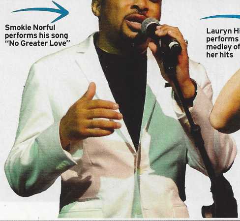
Smokie Norful performs his song "No Greater Love"