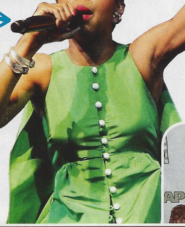
Lauryn Hill performs a medley of her hits